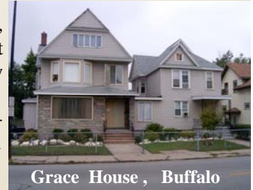
Grace House , Buffalo

acquisition of property, total facility renovations with mechanical upgrades and establishment of a valued community resource referred to as the "Grace House" Transitional Residence Program.