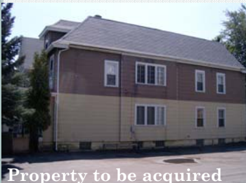
Property to be acquired

Simply put, we need more beds, more staff and more provision. However, I thank God he built this ministry slowly, with purpose and a firm foundation. Our growth has been in His time. Though I often didn’t understand His plans, I do appreciate His end product and His results.