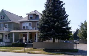
Property to be acquired

We are awaiting word from the New York State Office of Temporary Disability Assistance regarding our pending application for funding request that establishes and authorizes the construction of the 31 bed “Grace House” Special Needs Transitional Residence. This past June, all collaborative partners gathered in Buffalo along with OTDA application reviewers who performed a site review to determine if this project would be selected to receive funding. This is a competitive process with New York City projects often receiving the lion’s share of available funds. The collaborative working group acknowledged that the project was well presented and defined the need of our community and a project that offered a tangible solution to the burden of housing and reentry for men from prison presenting with special medical needs.