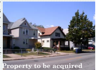
Property to be acquired