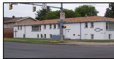
"Grace House" Rochester III Primary Program and Corporate Offices

It is your prayers, love and dedication that makes all the difference