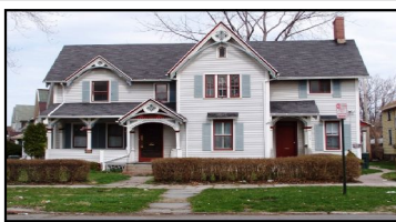
"Grace House" Rochester II Congregate Care Housing