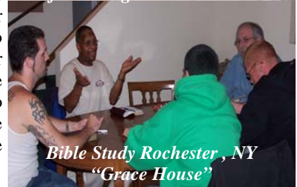
Bible Study Rochester, NY “Grace House”