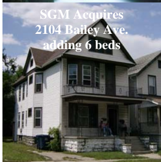
SGM Acquires 2104 Bailey Ave. adding 6 beds