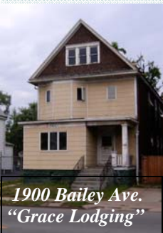
1900 Bailey Ave. “Grace Lodging”