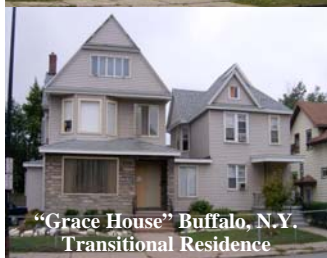
“Grace House” Buffalo, N.Y. Transitional Residence