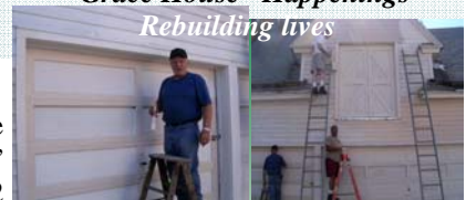
“Grace House” Happenings Rebuilding lives