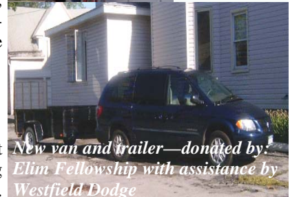
New van and trailer—donated by: Elim Fellowship with assistance by Westfield Dodge