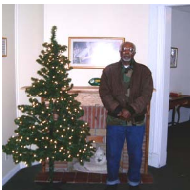
Getting ready for Christmas at "Grace House"

In August 2005, the women from The Veteran's Administration Medical Center came to paint at "Grace House". They painted the perimeter fence and foundation around "Grace House".